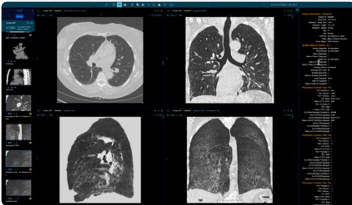
PLATFORM CASE VIEWER

OSIC Collaborative Research Network (OCRN)